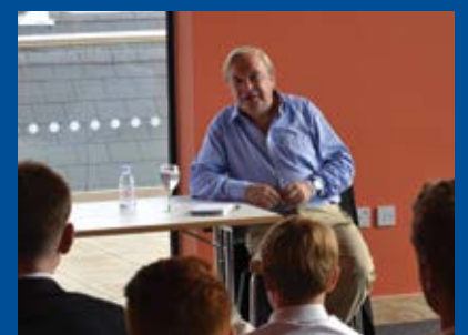
Boys were thrilled to hear Guardian Theatre Critic Michael Billington OBE (WS 1949-57) when he spoke to the Literary Society last term.