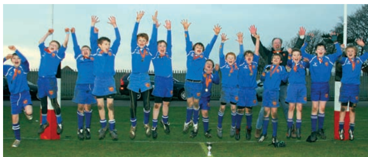
U11 National Champions.

A Warwick School team has been crowned national champions once more. The U11 team, having won the National U10 title last year, won a National Final again.