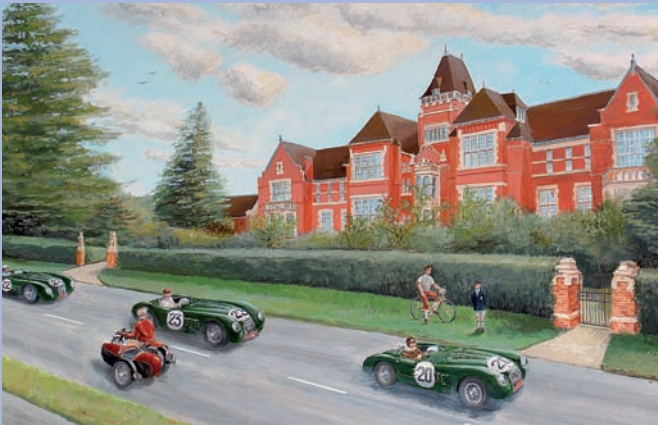
'En Route to Le Mans 1951.'