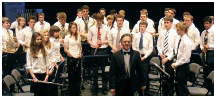
The Foundation Wind Orchestra.

gave storming performances to walk away with Gold Awards from this prestigious national music festival.