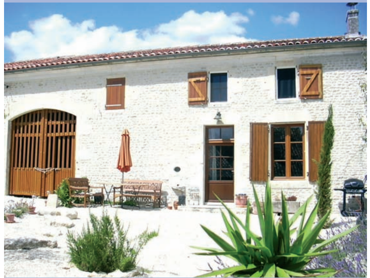
The gîte in Cognac.

If you would like to enjoy two weeks in Cognac by donating £500 to the school museum, please E-mail ad@warwickschool.org . 'Two weeks in Cognac' will be offered on a first come, first served basis.