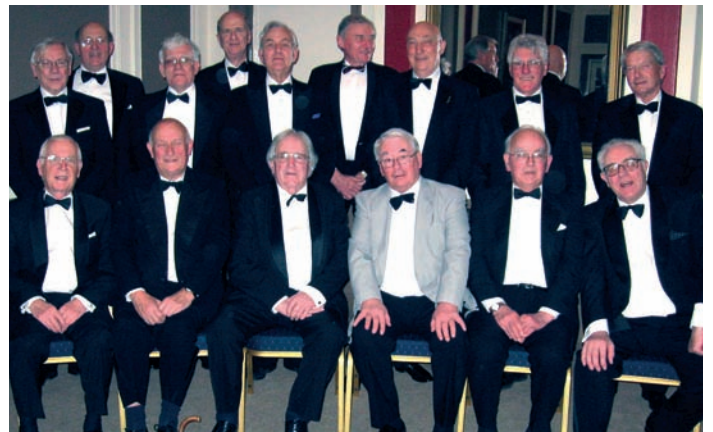
The 'School House Group' 2009 Dinner in Warwick.