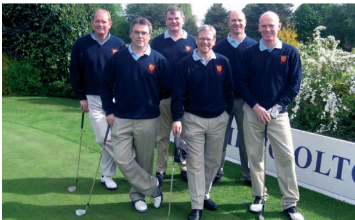
The 2009 Grafton Morrish qualifiers.