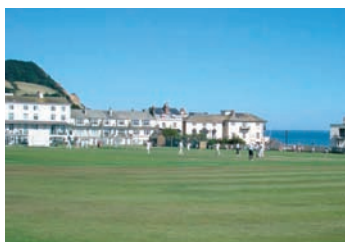
Sidmouth Cricket Club.

Day Two will be an all day game against a Sidmouth side. The cost is £12 per person and will include lunch.