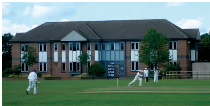
OW Cricket 2008.

We also wish our OWs every success as they play in the BM Cricket World Trophy Knock Out Competition