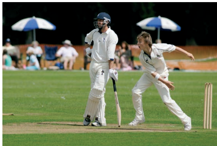
Lord's Taverners Charity Cricket Day 2008.