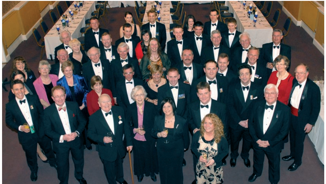
The inaugural OW Armed Forces Dinner.

There are plans for a second OW Armed Forces Dinner towards the end of 2010. Watch this space for further details!