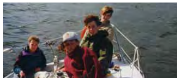
1994 Lake District sailing.