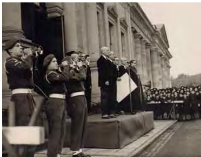
1952 Proclamation, courtesy Coventry Telegraph.