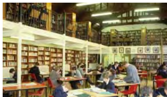
1990s The Library.