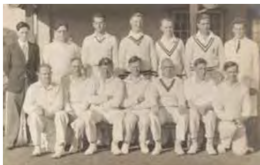
1950 Staff Cricket