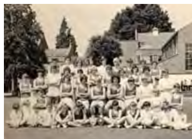
c. 1970 Athletics Team

Please keep sending in your photos to Alumni Relations at Warwick School, Email: ad@warwickschool.org .