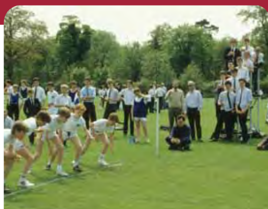
1990s Sports Day.

Old Warwickians who left Warwick School between 1990 and 1999, and the staff who taught them, are warmly invited to this landmark reunion which takes place at school on Saturday 30 June 2012. The reunion will be a very special day for renewing friendships, seeing former teachers, reminiscing about your school days in the 1990s and seeing the superb facilities that Warwick School offers boys today.