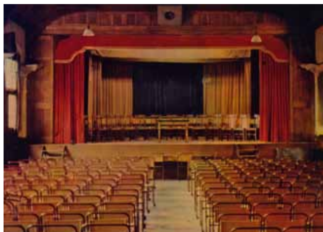
1950 Big School