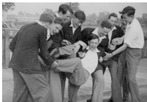
1955 Three, two, one...