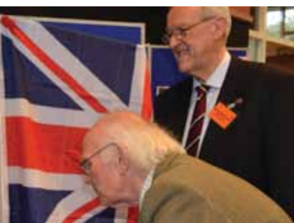
The photographic displays.

“I hope that you will think of an equally imaginative excuse for a party within the next sixty years, otherwise I might miss it.”