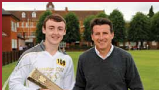
Lord Coe supported the Lord's Taverners match on 1 July.