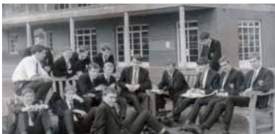
1968 Outside Tuck Shop.