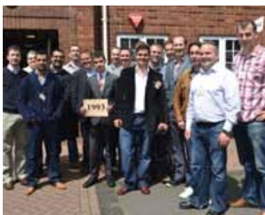
The class of '93.