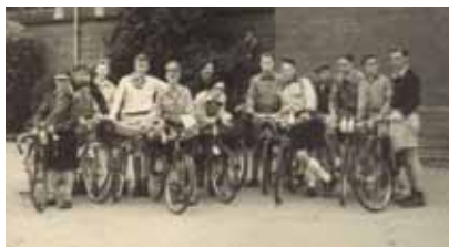
1951 start of tour to Rhineland, courtesy A Dugdale.