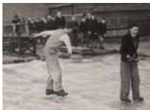
1940 Skating on the baths

Please keep sending in your photos to Alumni Relations at Warwick School, Email: ad@warwickschool.org .