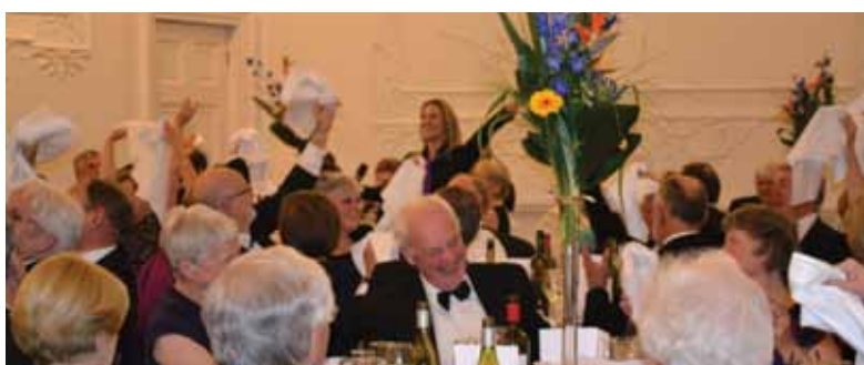
The Singing Waiters provided superb entertainment.