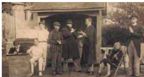
1946 Headmaster's Garden, courtesy J Winterburn.