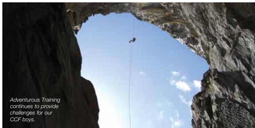
Adventurous Training continues to provide challenges for our CCF boys.

Warwick School cricketers enjoyed a very successful season with two teams finishing as County and Midlands champions. The school was also delighted to host one day of the Visually Impaired Cricket Ashes series.