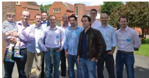
The class of '97.