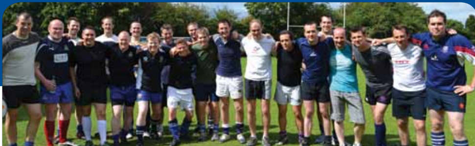
Enthusiasts assemble for the touch rugby.