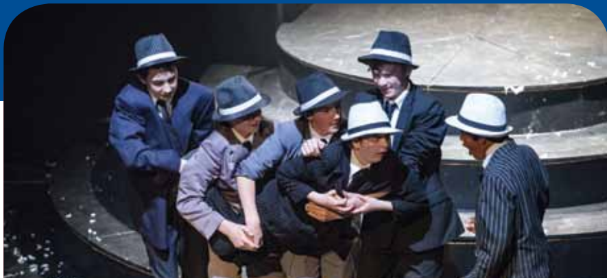
The Drama Department has impressed audiences at home and abroad. The diverse productions of Pravda and Bugsy Malone provided entertainment of the highest quality. Twenty two members of the Foundation's Youth Theatre performed a version of Alice Through the Looking Glass at five different schools in Canada.