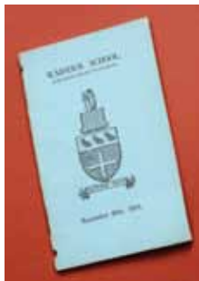
The very first Blue Book 1934.