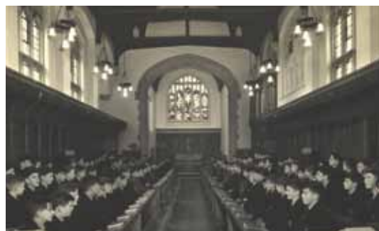
Early 1960s Chapel.

All Old Warwickians who left Warwick School between 1960 and 1969, and the staff who taught them, are warmly invited to this landmark reunion which takes place at school on Saturday 29 June 2013. The reunion will be a very special day for renewing friendships, seeing former teachers, reminiscing about your school days in the 1960s and seeing the superb facilities that Warwick School offers boys today.