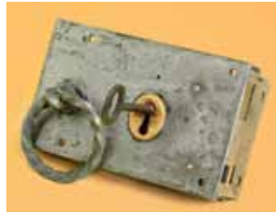
The original lock from the main front doors of the school. The lock was in use from 1879 to the early 1990s and was reunited with its original key in 2009.