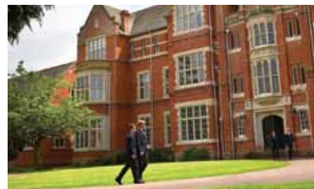
Warwick School today.