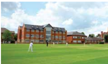
Cricket outside the Thornton Building.