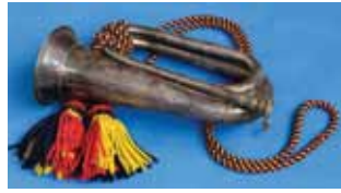
The OTC (CCF) bugle shown to Field Marshal Montgomery in 1947.