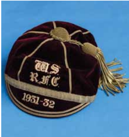
Warwick School Rugby Cap 1931-32.