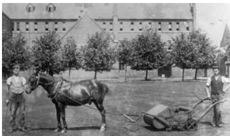
1897 Horse Drawn Mower.

Photography and editorial is being sourced for a new pictorial anniversary book of Warwick School, past and present. For more information and to find out how you can help, please see the leaflet enclosed with this newsletter.