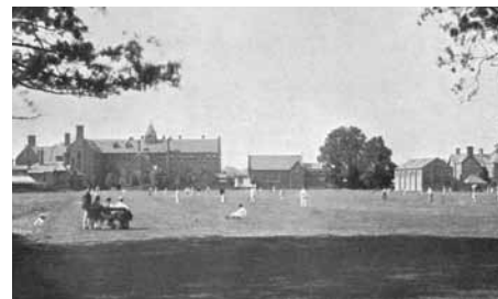
1900 Playing field.