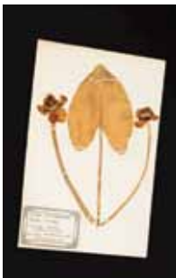
A water lily collected by a member of Warwick School on the day that the First World War started.

'Warwick School in 110 objects' is inspired by the History of the World in 100 Objects, a series of talks on BBC Radio 4 which were based on artifacts in the British Museum.