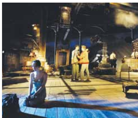
Twelfth Night, RSC.