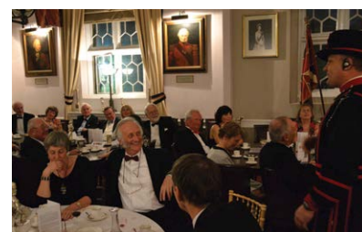
The Yeoman Warder outlines the Ceremony of the Keys.