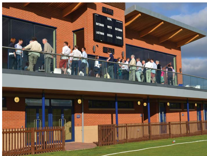
The Halse Sports Pavilion was a great venue for a summer reunion.