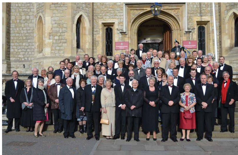
The party assemble on the steps of the Royal Regiment of Fusiliers HQ.