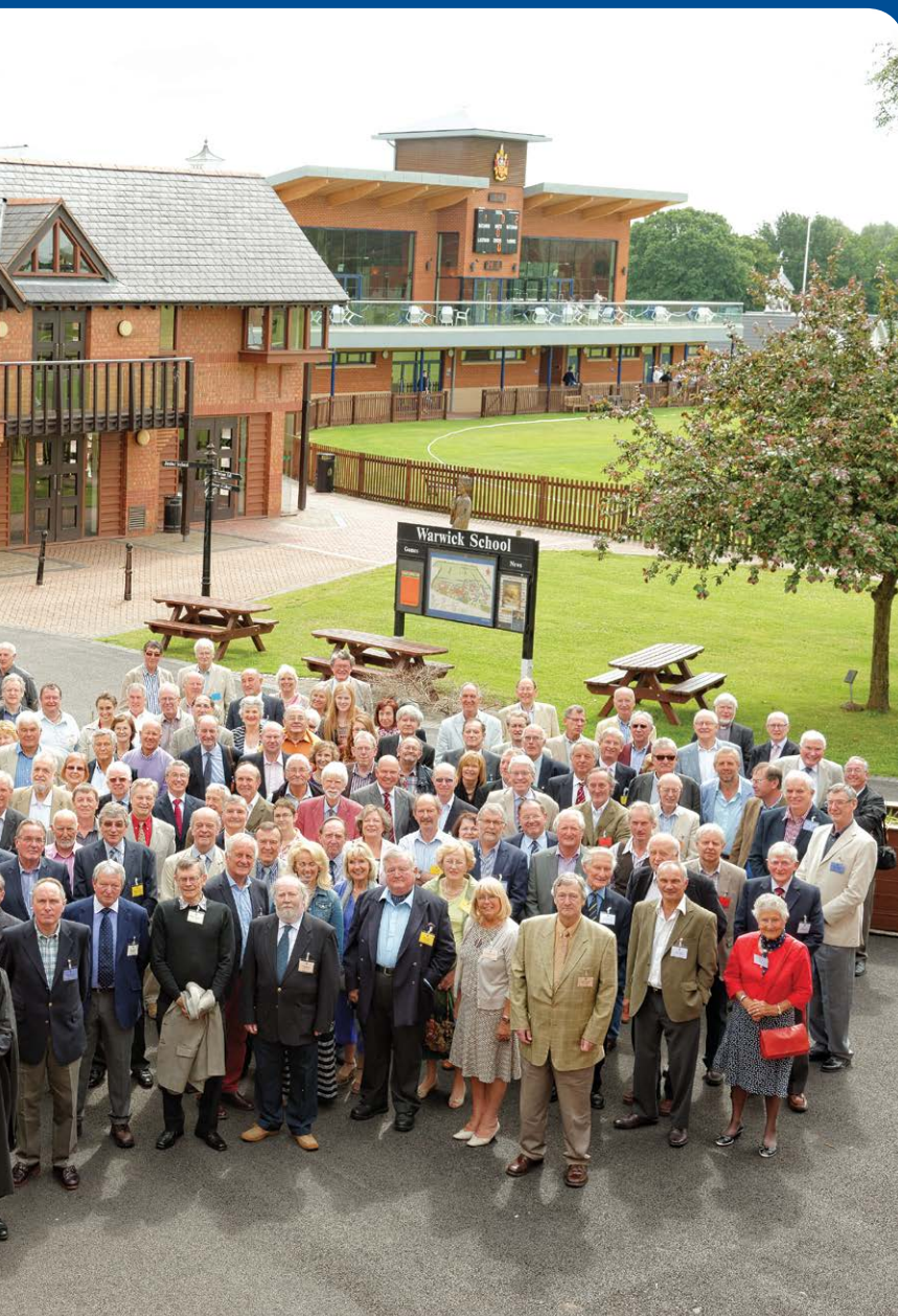
1960s Reunion Attendees.