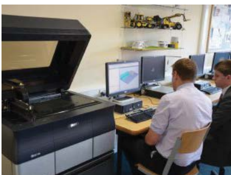
The DT department's new 3D Printer is proving a great success with boys.