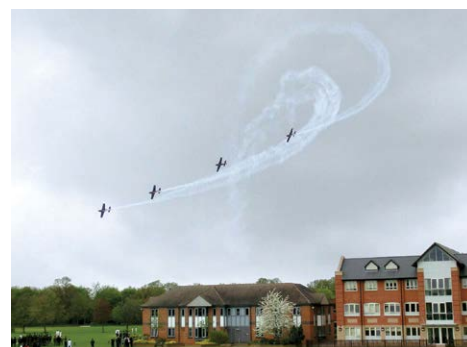
Pupils were given a short break from lessons to enjoy an aerial display from The Blades Aerobatic Display Team, having raised £8,000 for the Royal Air Force Association.