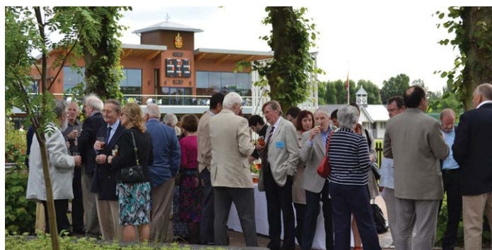
Pimms under the Limes.