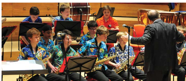
The Little Big Band won Platinum for the third year in succession at the National Concert Band Final.