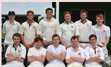
OWs 2nd XI