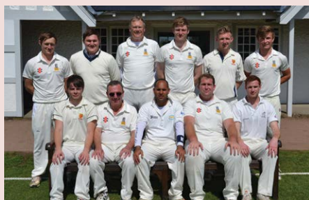
OWs 1st XI