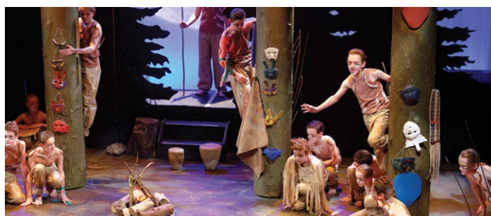
The school's production of 'Hiawatha' transported audiences to a world of wonderment and magic.