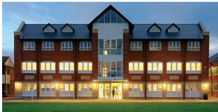
The newly opened Thornton Building.