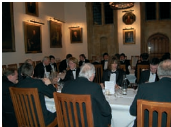
The McKenna Room, Christ Church.