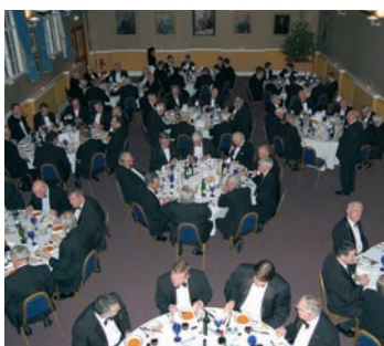
The OWA Annual Dinner, 2008.