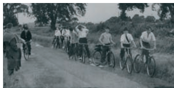
Bike race, 1958