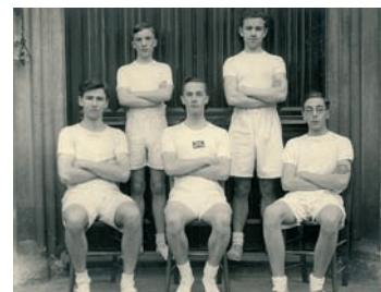
Gym Team, 1948.