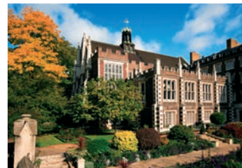
Middle Temple Hall.

Pre-dinner drinks will be served from 19.00 with dinner at 19.30. Carriages at 22.45.