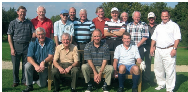
The sun shone on the autumn meeting at Broadway.

Thanks to all OWs who made it to Broadway for the autumn meeting on Friday 19 September 2008. The weather was glorious although the golf conditions were tough!