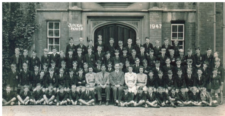
Junior House, 1947

See inside for full details of this landmark reunion.