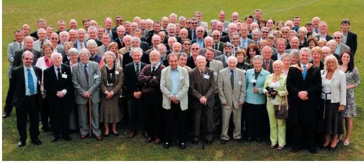
Sixties Reunion, 3 May 2008.