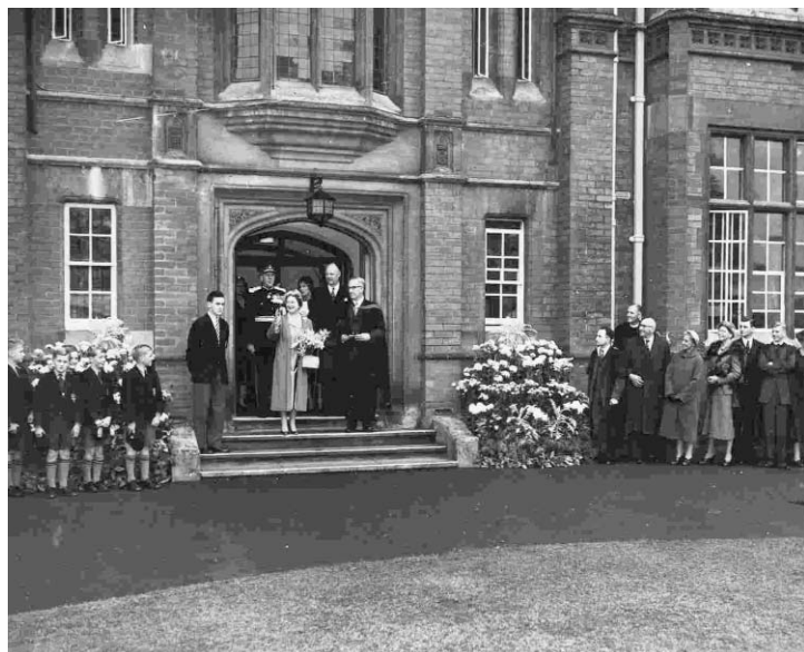
The Queen Mother at Warwick School in 1958.