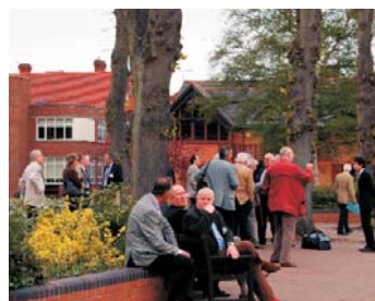
Warwick School 1960s Reunion.

As we develop our services and events for OWs, one of our key priorities is to improve our communications and give you all easy access to news from the school and your fellow OWs. We hope you enjoy reading these newsletters.