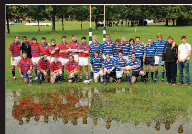
2008 OW Rugby Teams

As we go to press OWs are warming up for the annual OW rugby match, scheduled to take place on Saturday 12 September. A report on the match and rugby supper will follow in the next Old Warwickian newsletter.