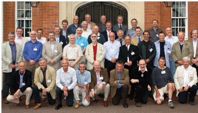
The class of '69 and the Head Master