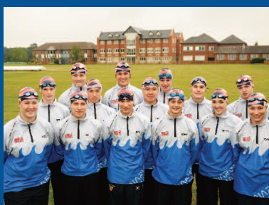
The English Channel swimming team