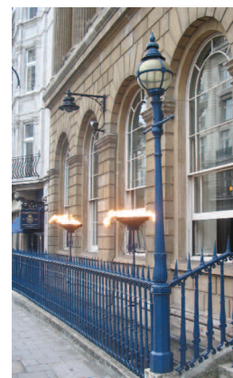
The Carlton Club

Dress: Lounge suit. Booking deadline: Friday 30 October 2009.