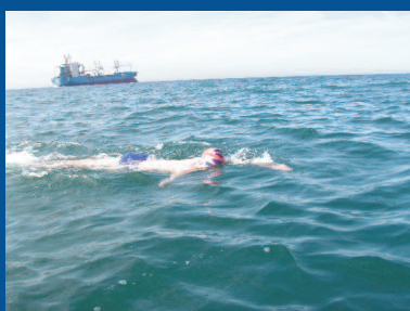
Racing the ferry!

Towards the end of the summer term a team of boys from Warwick School and girls from King's High took up the challenge of completing the world's most famous long distance relay swim.