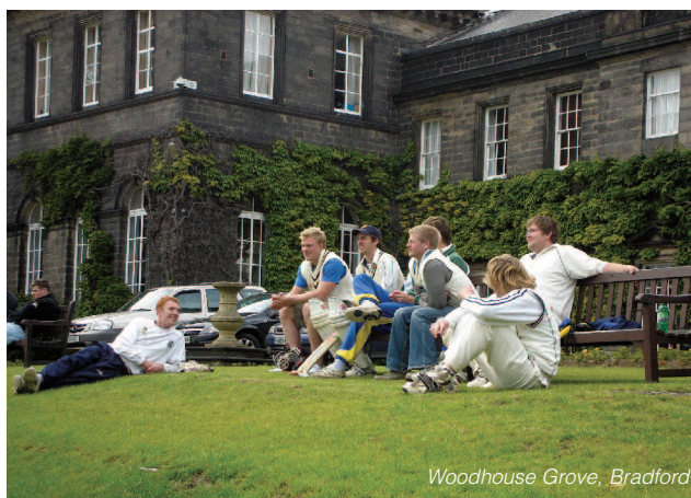
Woodhouse Grove, Bradford