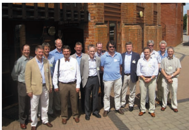
Some of our 1975 leavers.

"A truly glorious event. I find it difficult to put into words how much I enjoyed the day and the subsequent pub crawl that night with eight old friends who I hadn't seen for 34 years."