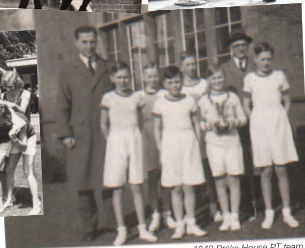
1940 Drake House PT team