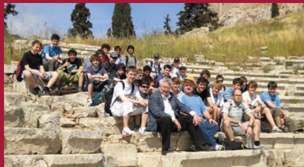
Classics trip to Greece.

Boys have travelled to Kyrgyzstan, South Africa, the United States, South America, China, India and many countries in Europe. There is a growing list of schools with which we exchange.