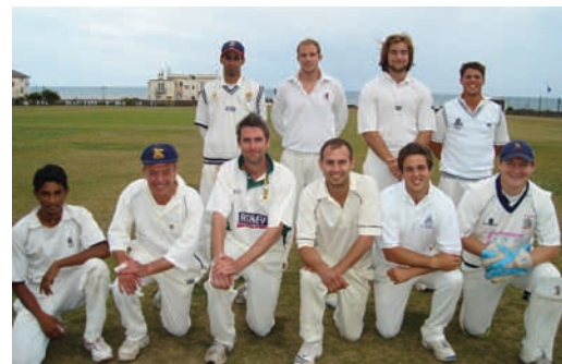
The Sidmouth team.

The aim is to keep growing this tour year on year, but we do please need your support. The cricket is to a high level and the venue superb, so we would ask all OW cricketers to please make a real effort to be available for 2011.