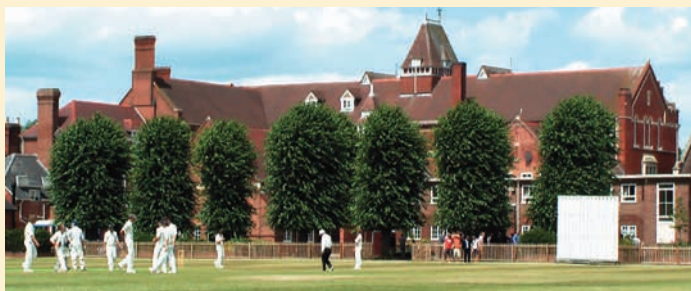
Saturday 3 July.