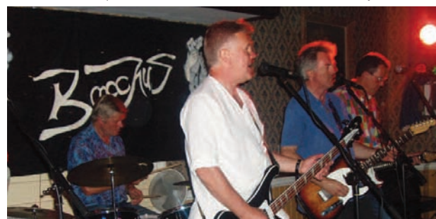
Bacchus return to school.

"An emotional 'rollercoaster' of a day, planned and executed to perfection. I felt we were going to lift off the Chapel roof when we all sang 'I vow to thee my country'. I wasn't crying, honest, something must have got in my eye! A truly awesome day."