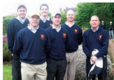
The 2010 Grafton Morrish qualifiers.

The finals take place 30 Sept-2 Oct 2010.