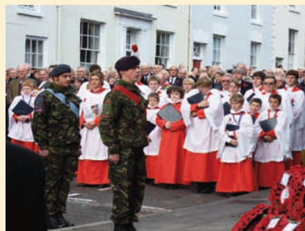
Remembrance Parade, Warwick.

All boys and their families, Old Warwickians and all members of the school community are welcome at Chapel Services.