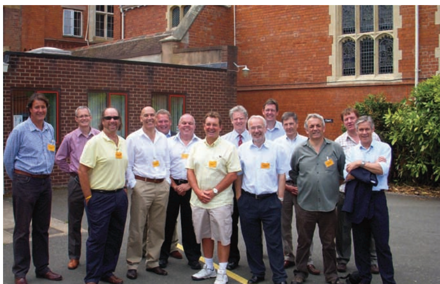
Some of our 1973 leavers.

Three hundred 1970s OWs and guests enjoyed a very special day at school on Saturday 3 July 2010.