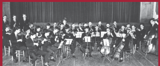
1962 School Orchestra – Courtesy Ron Lowe (WS 1958-65).