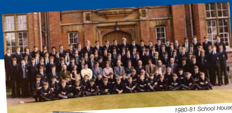
1980-81 School House.

A list of those attending is posted and updated regularly on www.oldwarwickians.org .