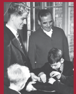
1954 Visit from the Town Crier – Courtesy L Victor McDonald (WS 1947-54).