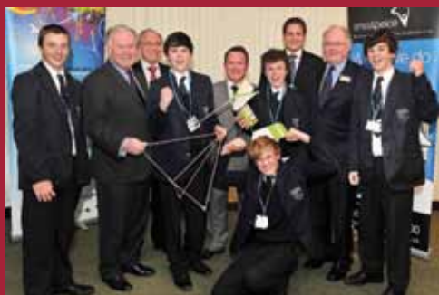
Warwick School engineers celebrate their success.

Budding engineers from Warwick School won a Renewable Energy Challenge grand final which was held at the House of Commons in January. Each competing school was challenged to build a structurally sound wind turbine using a variety of resources and materials. The boys' final designs were assessed for effectiveness, aesthetics, power output and build costs.