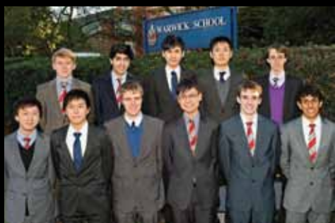
Good luck to these and all our boys taking A levels this summer.

Twelve Warwick School students have been offered places at Oxford and Cambridge Universities. The students are set to study their chosen subjects which include Engineering, Philosophy, Classics, Medicine and Natural Sciences.