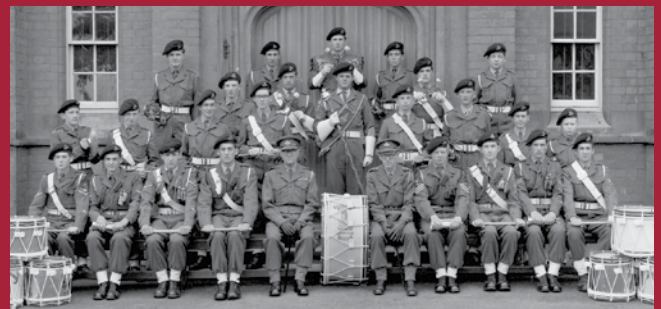
1963 CCF Band – Courtesy Paul Wilmot (WS 1959-64).