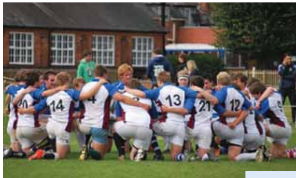
Team talk before the 2010 match vs. Old Silhillians.

Old Warwickians will take on Old Silhillians at Warwick School on Sat 24 Sept at 12.00. Last year's match was played in great spirit with some great tries, scrums and tackles. This year's squad will be strengthened by the return of five OWs who left in 2001 who, to mark their ten year anniversary of leaving school, have set themselves the personal challenge of playing with the OW team. All supporters are very welcome.