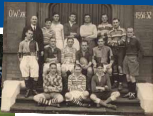
A picture from the archives – 1931-32 OWs 1st XV.