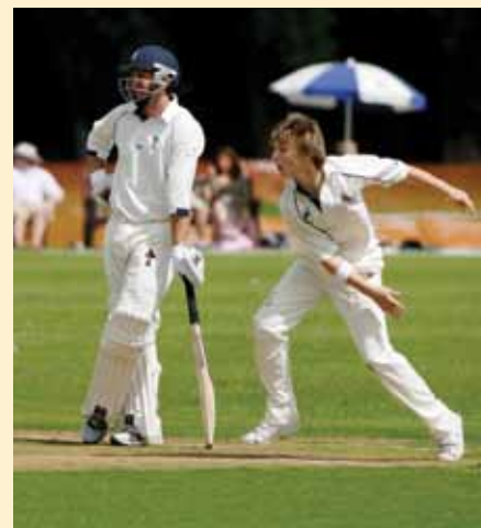
Lord's Taverners 2009.