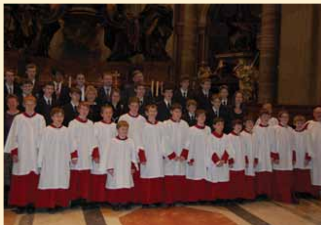
The Warwick School Choir.

In February half term the Warwick School Choir visited Rome for the experience of a lifetime. Highlights of the trip included singing High Mass in St. Peter's Basilica. On 23 February, at the Papal Audience, the choir sang Mozart's Dona Nobis Pacem . The trip was a fantastic success and one that will be remembered for a long time to come.