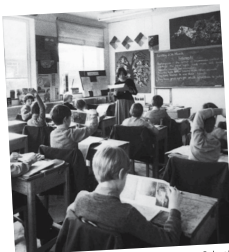
1979 Junior School.

From previous experience, we expect many OWs will want to get together informally in the evening in local pubs or restaurants. If you would like to arrange something in advance of the event, an online password protected page of contact E-mails will be available for those who are happy to circulate their E-mail address to other attendees.