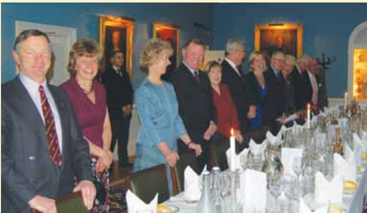
Guests gather for dinner in the Champney's Room.