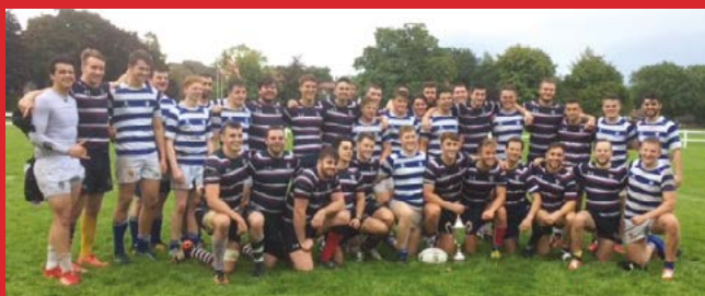
Fresh faces and old rivals.

Sat 9 Sept 2017 – OWs vs. Old Silhillians