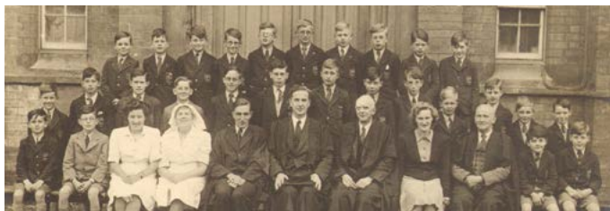
1946 Junior Boarders.

OWs may park in any of the school car parks. The most convenient car parks are those near the Warwick Hall. It is a 5-10 minute level walk (with speed bumps) from the Warwick Hall to Chapel. Please advise, when booking, if you require downstairs seating in Chapel, if you would like a disabled parking space and if you have any special needs or requirements.