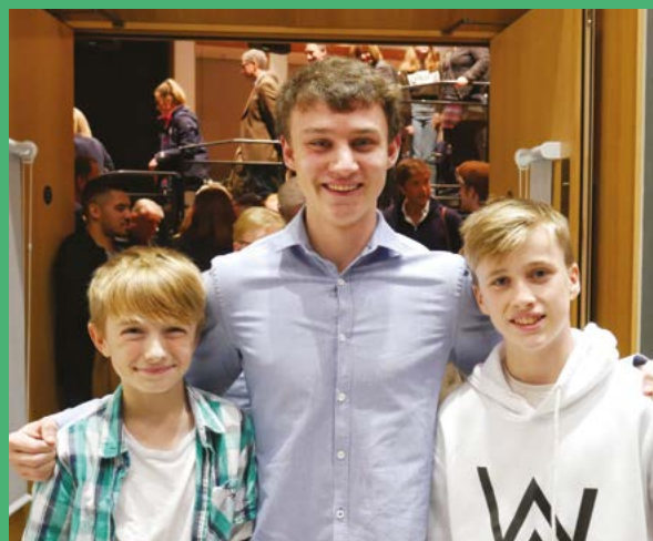
A trio of Gavroches!