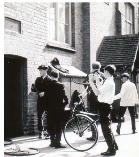
1968 Outside cycle store.