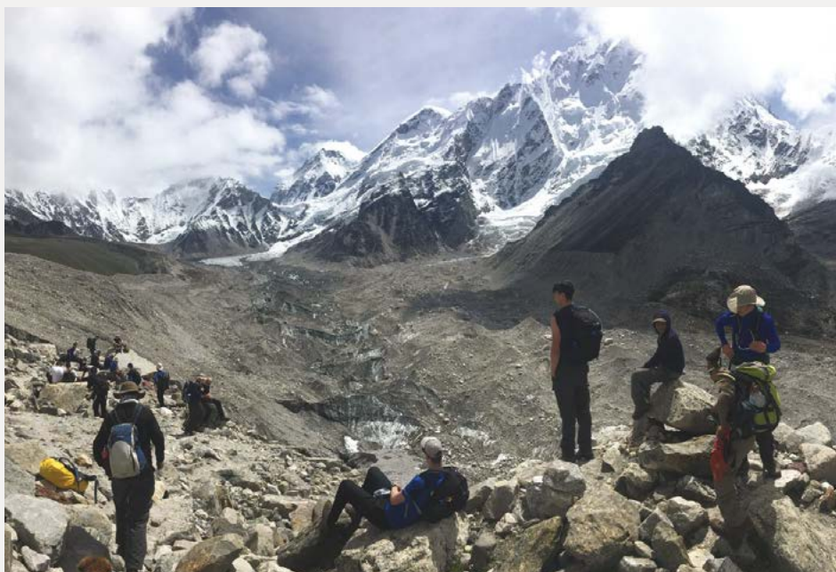
The Everest Base Camp Trail.

Over the summer holidays, 17 boys and two members of staff took on the massive challenge of the Everest Base Camp Trail.