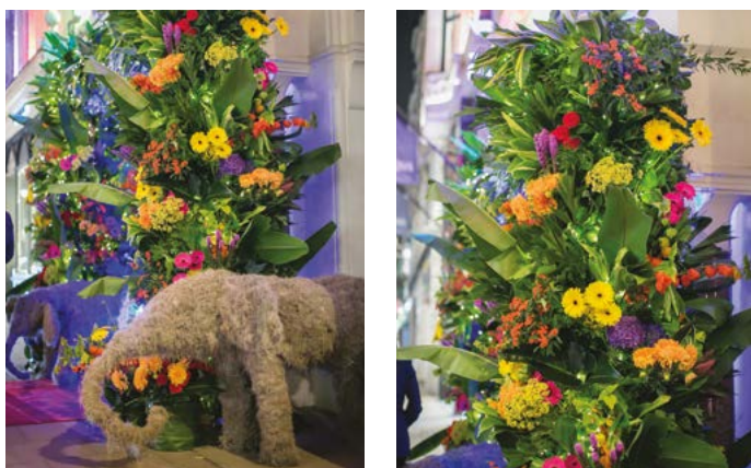
Celebrating Diwali at Sotherby's.