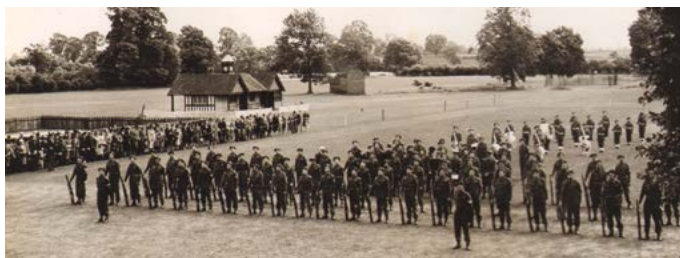
1949 Speech Day and JTC Inspection by Field Marshall Montgomery.