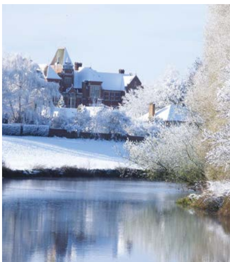
2008 Snow on 6 April.