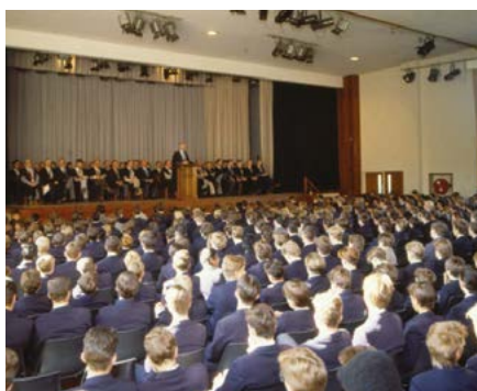
1990s Assembly in the Guy Nelson Hall.