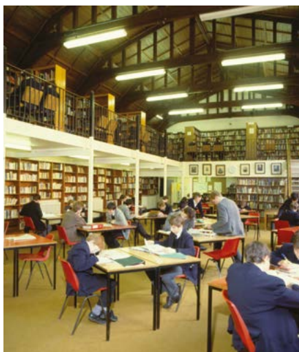
1990s The library.

These anniversary reunions are for those who left at the end of the Upper Sixth in 1968, '78, '88, '98 and 2008, plus classmates who left earlier, including those who left two years early, after O levels or GCSEs.