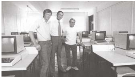
1980s First computer room at Warwick School.