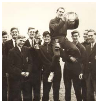
1957 School House Athletics team.