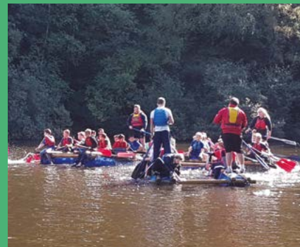
Lower Fourth boys on their bonding weekend.

We started the new academic year with 1,247 pupils on the school roll and recorded the second highest number of entrants for 11+ admission in September 2018.