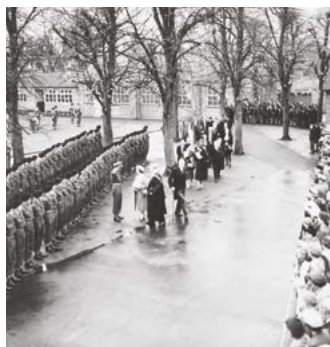
1958 Queen Mother's visit.