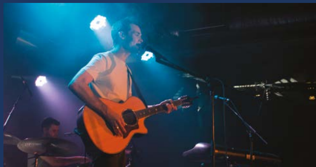
James TW (WS 2005-15).

Singer-songwriter James TW (WS 2005-15) has completed his first headline tour of the UK and Europe. James played to sell-out audiences in many countries including Portugal, France, Germany and Sweden. His new single For you was released in October.