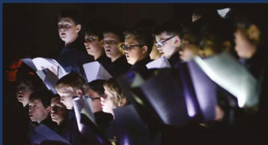
Boys performing Lux Noxque.