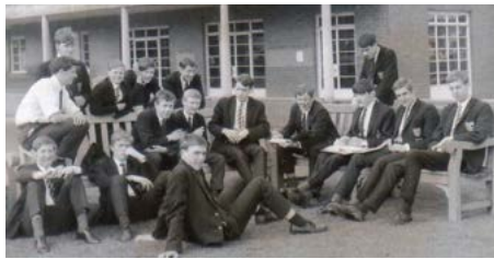
1968 Outside Tuck Shop.