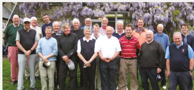
Golfers at the OW Spring Golf Day 2017.

We hope to see as many OWs there as possible – bring a friend if you can!