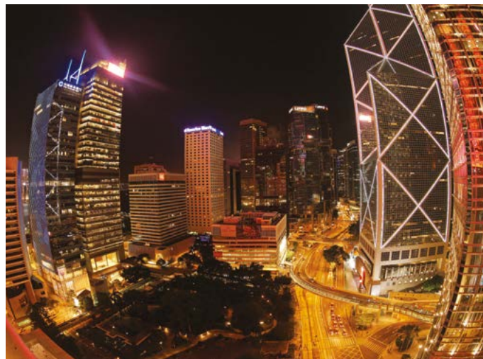
View from The China Club.