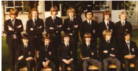
1978 Leavers (photo taken 1975).