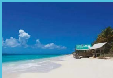
The Dune Preserve, Rendezvous Bay, pre-Irma. This building is no longer there.

Anguilla is a stunning British Overseas Territory in the Caribbean that briefly made the UK news last September when Hurricane Irma thundered through and thoroughly decimated it. The Category 5 monster, with wind gusts of over 200 mph, has left Anguilla with major