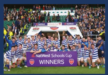
2017 U18 winners.

A double Twickenham final was an accolade to all the boys for a season of tremendous rugby. Huge thanks to the hundreds of OWs who supported the teams – both in person at Twickenham and online from office desks, bar stools and armchairs across the globe (the matches were streamed live on YouTube).