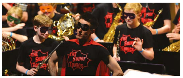
The Super Tonics.

Warwick School was proud to host this year's National Concert Band Festival Finals in the new Warwick Hall. Five Warwick School Foundation bands qualified for the national final (more than any other school in the country) and emerged with two Platinum and three Gold awards. Jazz Lab and Foundation Wind Orchestra won Platinum, while The Super Tonics, Little Big Band and Big Band all won Gold.