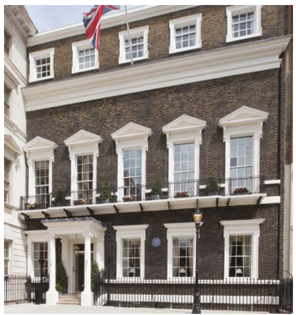
The Naval and Military Club.

Booking deadline: Tuesday 31 October 2017.