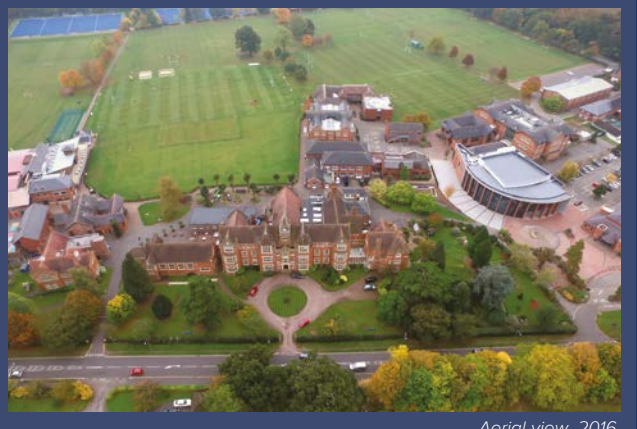
Aerial view, 2016.

Reunions to mark 50, 40, 30, 20 and 10 years since leaving school.