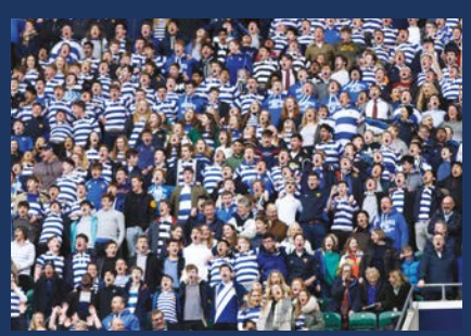
Fantastic support from the WS community.