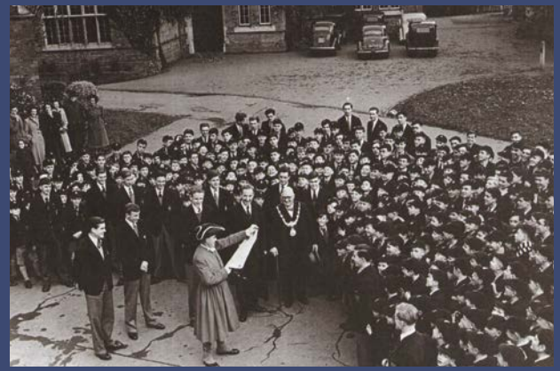
Town Crier's visit in the 1950.

A special Lunch and Chapel Service for all those who were at Warwick School in the 1940s and '50s.