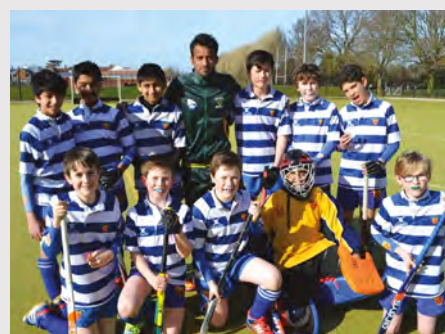
2015 Muhammad Irfan visit.