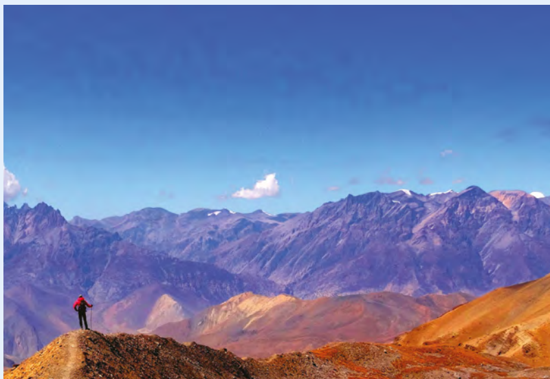
Alex descending the Thorong La Pass at about 5,000m.