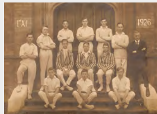
1st XI, 1926.