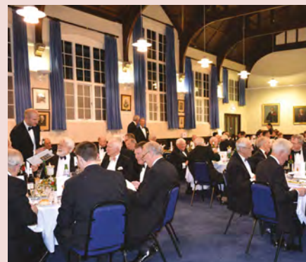
The Pyne Room.