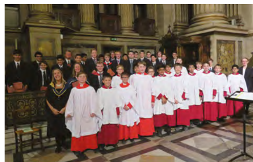
The choir sang in Notre Dame at Easter.

Art, Music and Drama continue to flourish and boys enjoy a fantastic range of academic, sporting and cultural trips and tours.