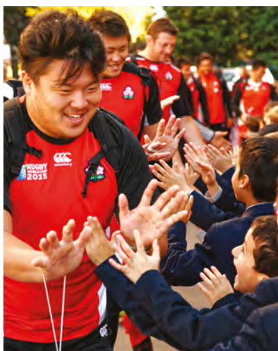
WS boys welcome the Japanese team.

Younger children at Warwick School welcomed the team when they first arrived. During their stay, while the main focus was on training, the players found time to talk to boys at School. Our older rugby players were also enormously privileged to attend a training session with the six coaches from the Japanese team, including head coach Eddie Jones.