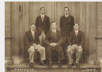
A H B Bishop and Prefects, 1946.