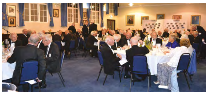
Dinner in the Pyne Room (Big School).