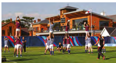
Training with the Japanese coaches.