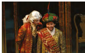
Coram Boy 2008.

The Bridge House Theatre – Fri 4 March 2016