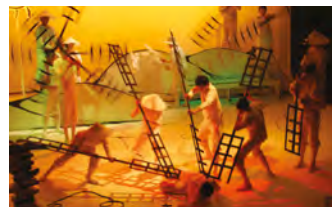
Don Quixote 2009.