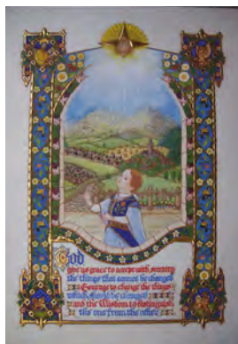
God give us Grace.