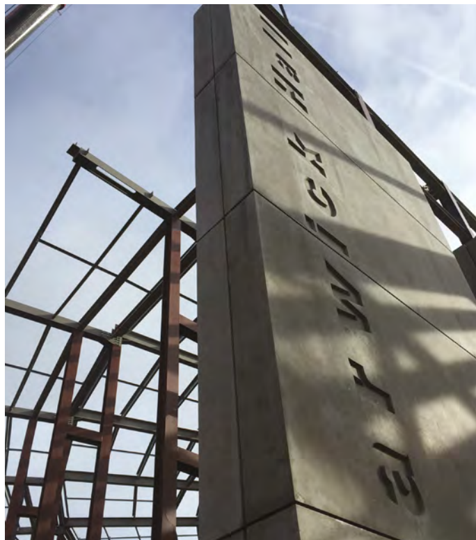
The Hall under construction.