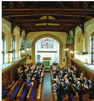
Chapel, before the Dinner.