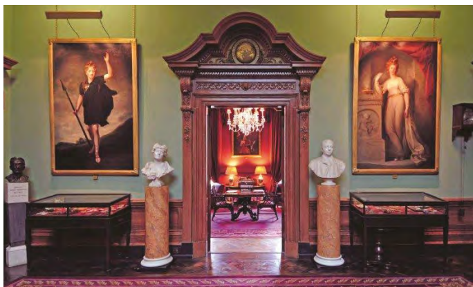
The Garrick Club.