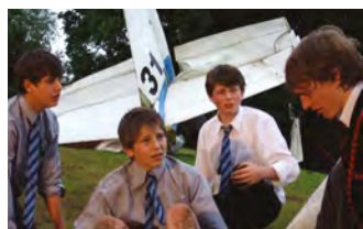
Lord of the Flies 2007.