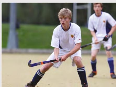
Warwick School hockey, 2012.